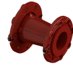
DN 50 a DN 600