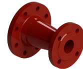
DN 700 a DN 1000