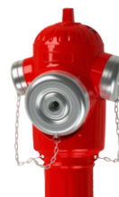
Inviolable blank caps of the Classic fire hydrant [ref. 07.200]