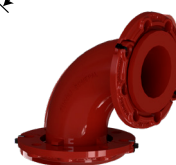
DN 40 to DN 600