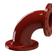
DN 700 to DN 1000