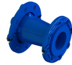
DN 50 a DN 600