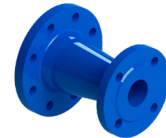
DN 700 a DN 1000