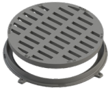
Redonda 50 D400