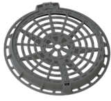
Redonda 60 D400 c/ Eixo e Dobradiça