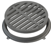
Redonda 60 D400