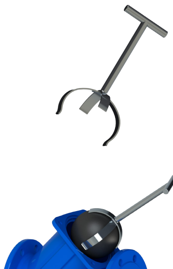
Removal of the ball