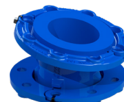
DN 40 to DN 600